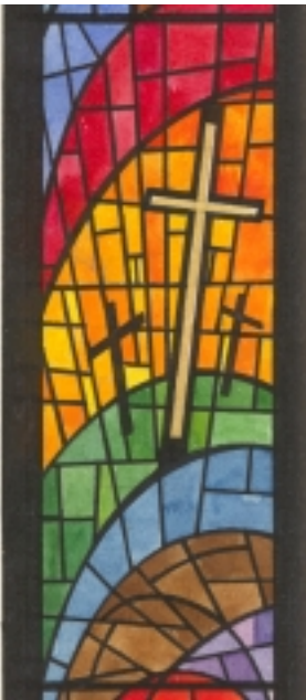
The Three Crosses on the Hill