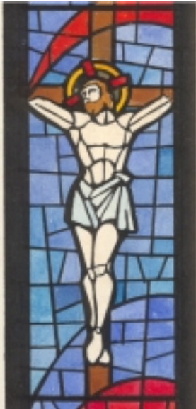
Christ on the Cross